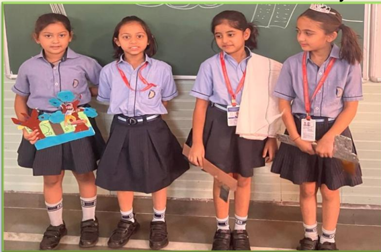
POD CAST BY HERITAGE CLUB