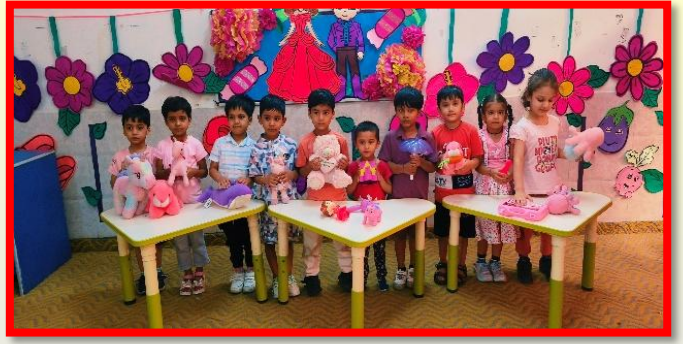
COLOUR DAY - PINK & PURPLE