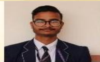
KRISHNA Artificial Intelligence