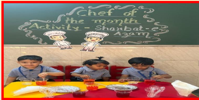
COOKING WITHOUT FIRE