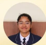
ANGEL Artificial Intelligence