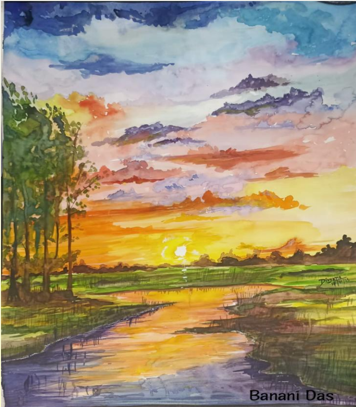
Banani Das ( XII-Lily)