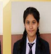
ANUSRI - 92.8%