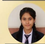
ANUSRI Artificial Intelligence