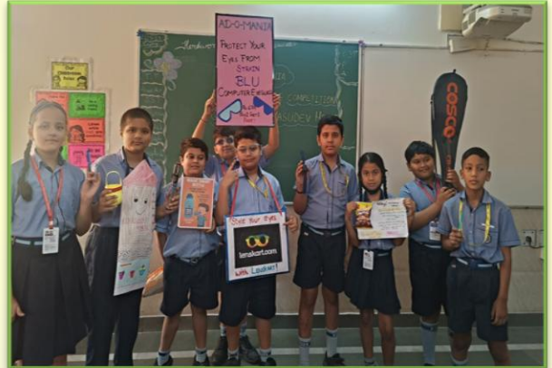
STORY WITH A TWIST