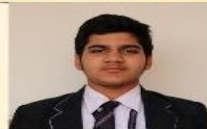
SAPTRISHI Artificial Intelligence