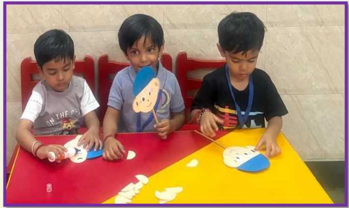
WHO AM I ?