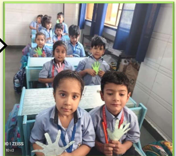
FIND MY HOME