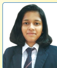
ANUSHKA SHARMA (91.6%)